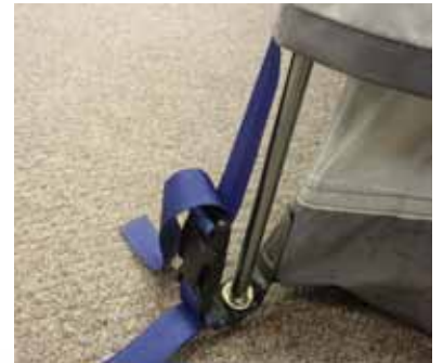
Rain Fly Attachment