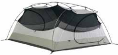
Zia 3 pictured

Package Includes: Tent Body, Rain Fly, 2 Hoop poles, 1 X hub ridge pole, 4 Guy Cords, 6 Ground Stakes, 1 Pole Sack with stake pocket.