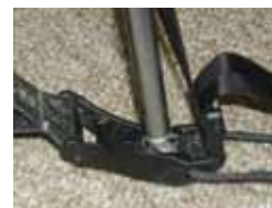
Jake's Foot™ Fly Attachment