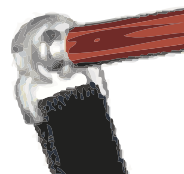
Ball Cap Assembly™