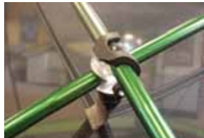
Locking Swivel C Hub™ w/ H-Clip™