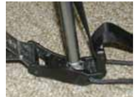
Jake's Foot™ Fly Attachment