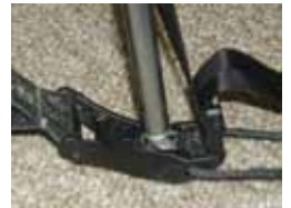
Jake's Foot™ Fly Attachment