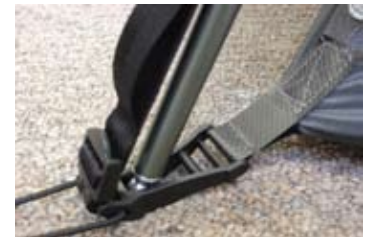
Jakes Foot™ w/rain fly clip