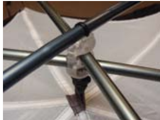
Swivel HC Hub™