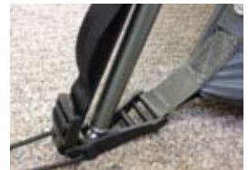
Jake's Foot™ Fly Attachment