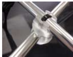
Swivel C Hub™